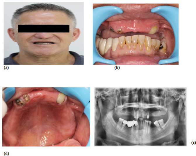
Figure 3. Pre-operative clinical photographs and panoramic radiograph of a full arch rehabilitation case: (a) Patient's smile; (b) Intraoral view of the maxillary buccal aspects; (c) Intraoral view of the maxillary palatal aspects; (d) panoramic radiograph.

Cobalt chromium framework was printed by direct metal laser sintering (DMLS) and checked intraorally. Secondary bite was registered, teeth shade selected using Vita shade guide (Vita Zahnfabrik, Bad Sackingen, GmbH, Germany). Ceramic bisque layering was done and examined intraorally. Final occlusion adjustment was done and the bridge was sent for glazing. The patient was then rehabilitated with permanent screw retained porcelain to metal fixed prosthesis. The prosthetic screws were tightened with 30N/cm torque. After prosthesis placement, panoramic radiograph was done (Figures 3-4). The patients were advised to adhere to meticulous oral hygiene maintenance, hygienists visits and annual follow up. The full technique protocol was described in details by Nag PVR, et al. [19].