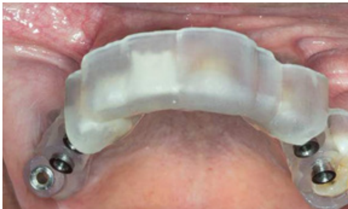
Figure 1: Teeth supported surgical guide is placed over the remaining teeth and the maxillary ridges and its stability is examined. In totally edentulous cases, mucosa supported guide was used.

Patient consent was obtained prior to surgical procedure. All patients have self-volunteered to participate in the study analysis. A Cone Beam Computed Tomography (CBCT) was performed in each case. The dicom image files were converted to STL files, on which the surgical planning was done using specific software (BlueSkyPlan, United States). Vital anatomic structures, such as sinus walls and pterygoid venous plexus, were identified and excluded from the planned operative field. Local anesthesia with 2% lidocaine hydrochloride and adrenaline (1:200000) was given. In a flapless approach, TTPHIL mucosa supported surgical guide was placed intraorally above the alveolar ridge (In2Guide, Cybermed Inc., USA). In partial edentulous cases, teeth supported guide was used (Figure 1).